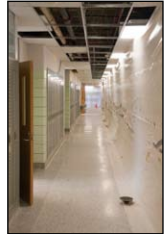
Right: Behind the curtain, the work goes on. The green wall tile will be left in place, but the area above will be painted with ribbons.