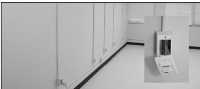
Left: NWC goes high-tech. Multiple data and power connections in a science lab.