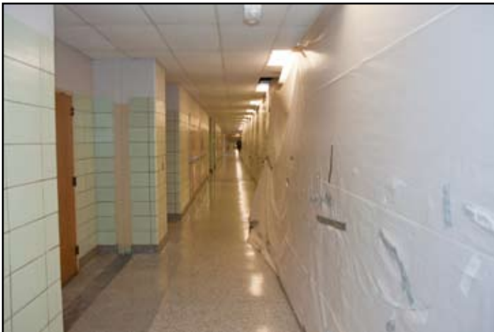
Left: The view of the west hall from the office. The plastic curtain bisects the hall to allow for traffic.