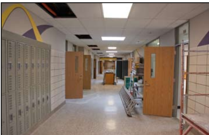
Lower left: The second floor's south hall is almost complete with new lockers, doors, ceilings and painted ribbons on the upper walls.