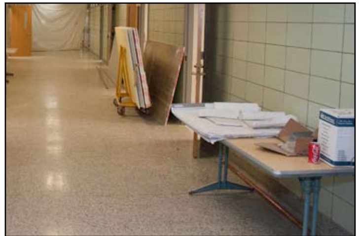
Right: The work area on the south hall, first floor.