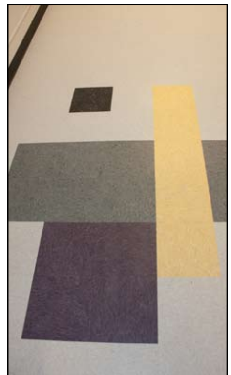
Right: The new floor tile pattern at the doorways to the classrooms in purple, gold and gray.